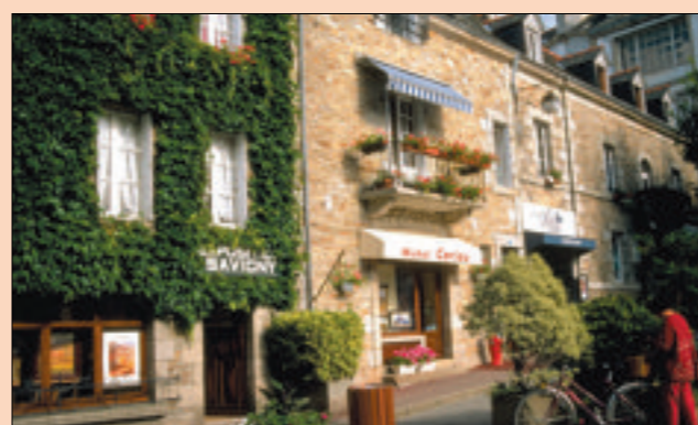
Inspiring Pont-Aven, an artists' colony in Finistère